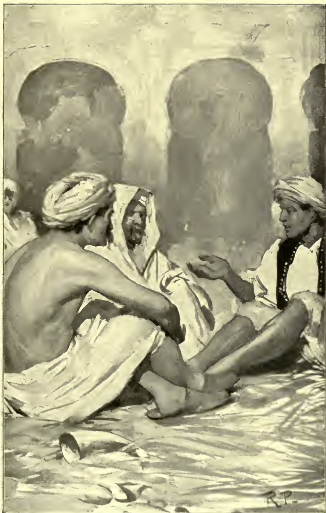
SIR GERVAISE IN PRISON ANSWERS THE QUESTIONS OF THE GALLEY-SLAVES.